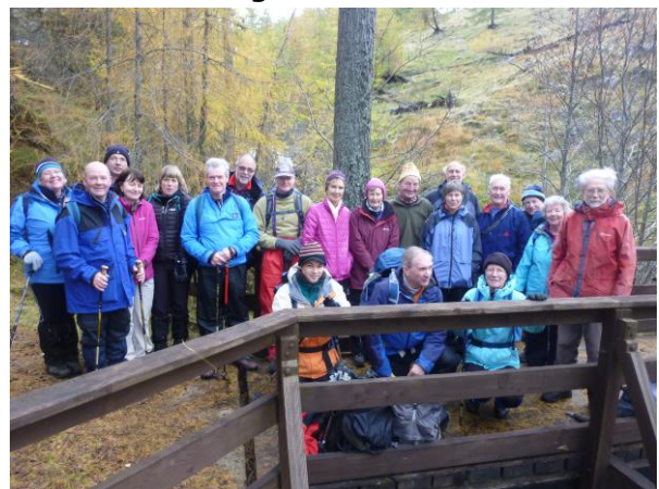
Presidents -1967 to the present (no Etta)