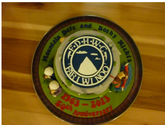
Dinner Sat 26 th October 2013